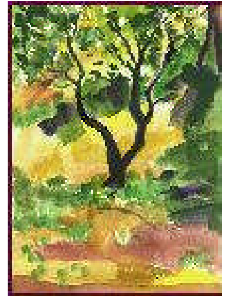
Jonah 4 9-11

GOD said, “What's this? How is it that you can change your feelings from pleasure to anger overnight about a mere shade tree that you did nothing to get? You neither planted nor watered it. It grew up one night and died the next night. So, why can't I likewise change what I feel about Nineveh from anger to pleasure, this big city of more than 120,000 childlike people who don't yet know right from wrong, to say nothing of all the innocent animals?”